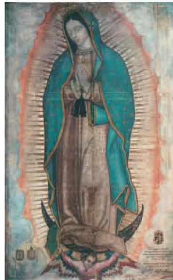
Our Lady of Guadalupe is the Patroness of the unborn, the Americas, and the Knights of Columbus.

Your participation in the Silver Rose program, especially your prayers and pledge for life, are a crucial part of our mission to defend and support life in every stage and condition.