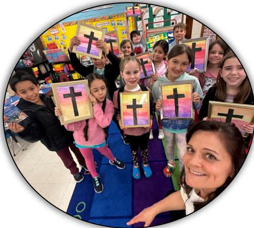
Grade 2 celebrating the LOVE of Jesus and their last day together for this Faith Formation year!

Registration for Faith Formation is now open. You may register online or call the office at 219-322-3077.