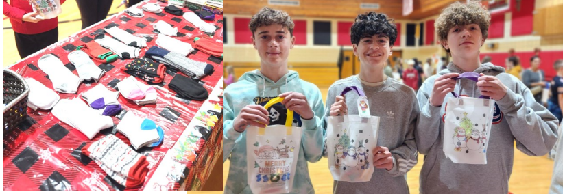
December 22, 2024