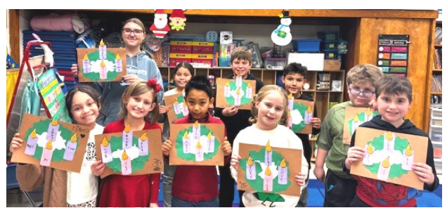
Third Grade Faith Formation Students creating an Advent Wreath in class to take home and share with their families during this Advent Season! HOPE... LOVE... JOY... PEACE