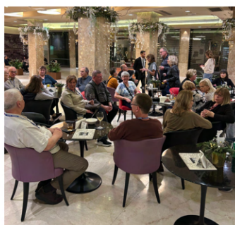
The intrepid pilgrims, enjoying a well-deserved cocktail before dinner.