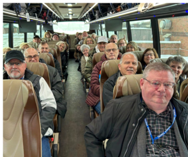
Departing from St. Michael Church.