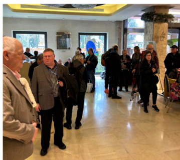
Pilgrims arriving safely at their first hotel in Firenze (Florence).