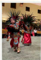
Danza Azteca - Chicago

Fellowship & Refreshments to follow in St. Patrick Hall.