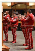
Mariachi Juvenil Zamora - Chicago