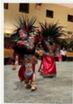
Danza Azteca - Chicago

Fellowship & Refreshments to follow in St. Patrick Hall.