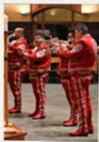
Mariachi Juvenil Zamora - Chicago