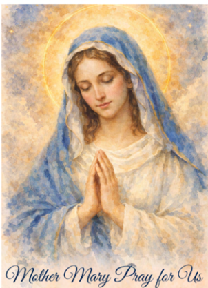
Mother Mary, Pray for Us