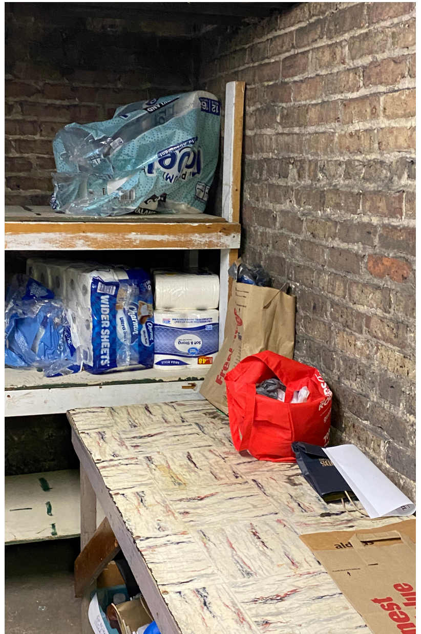
Images of the Good Samaritan food pantry in the basement of the parish office.